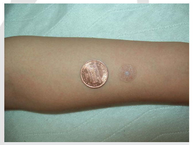
Fig. 3 Illustration of the indwelling acupuncture needle in situ. The indwelling acupuncture needle is illustrated in relation to a penny (diameter: 18 mm).

sample size calculation for subsequent randomized controlled trial was performed using the incidence of vomiting after initiation of therapy as a primary outcome endpoint.